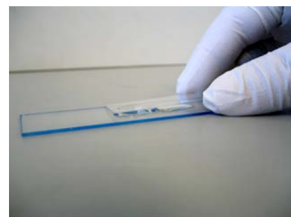
Fig. 2 Apply the coverslip from one end of the streak of CyGEL Sustain™ taking care not to trap bubbles. Once applied, cool the slide on an ice-pack to allow the CyGEL Sustain™ to liquefy and spread under the coverslip.